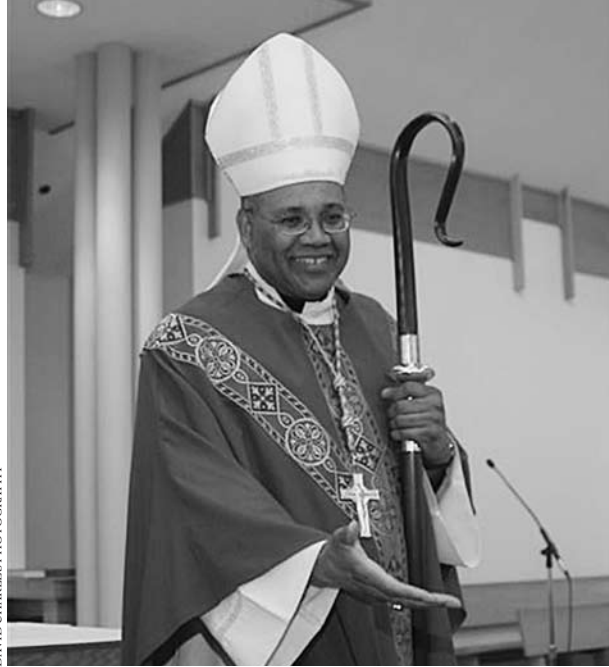
DAVID CHARLES PHOTOGRAPHY